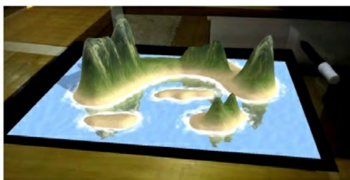
Figure 3: Image projected in 3D via LandscapAR

After scanning and capturing the image using the markers (code previously recognized by the software), the level curves are obtained. The program generates a 3D virtual projection (Figure 3), represented by a topographic profile, with great wealth of details (islands, surface shapes, shading and apparent movement of the liquid surface) allowing the user to overcome their imagination and abstraction difficulties on how they would be the shapes of the surface in reality, from the interpretation of the level curves (CARDOSO, 2014 p.332 apud RESENDE et. al., 2016).