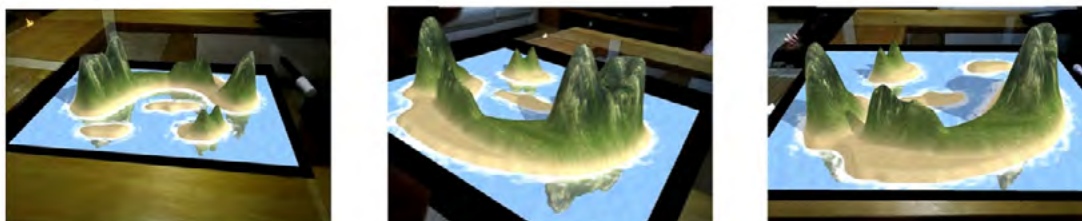
Figure 4: Different perspectives in 3D

From the contour of the contour lines, three-dimensional images are generated and projected that represent scenarios of large and small islands, providing the partial immersion of the student when viewing virtual objects overlaid on the wallet and the physical space of the classroom. surface / relief from reading the level curves on a sheet of paper. Furthermore, the image generated by the application allows the student's interactivity in different perspectives (Figure 4).