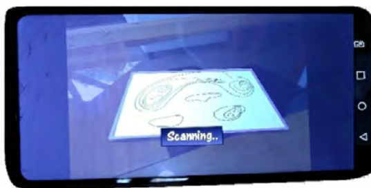
Figure 1: Scanning of contour lines via LandscapAR