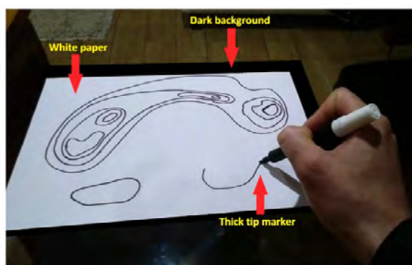
Figure 2: Recognition and scanning via LandscapAR

For this process to occur satisfactorily, the lines representing the contour lines must be drawn on light paper, with the use of a black pen with a thick tip, without the lines overlapping (Figure 2). In order to facilitate scanning, the paper must be clearly visible from a dark background (WEEKEND, 2018).